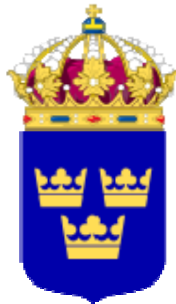
The lesser coat of arms of Sweden, as used by the Government